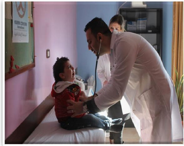
Naher El-Bared Pediatric clinic: Number of patients according to nationality and gender