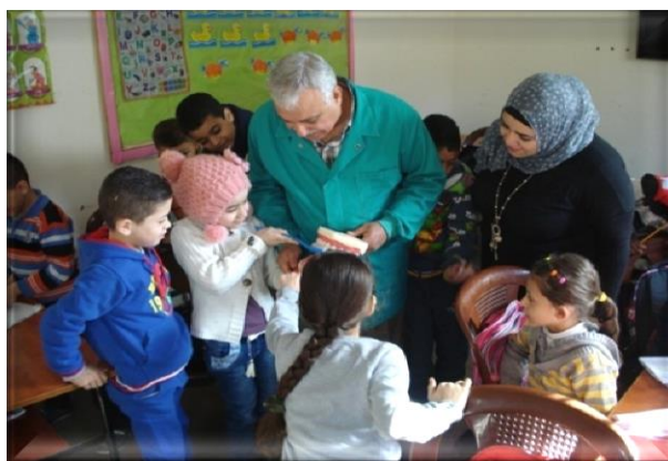
Dentist and teacher, can bring the oral health hygiene idea to the child

3a- prevention is number one intervention with school age children